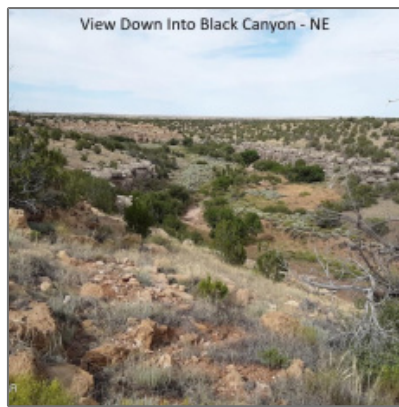
View Down Into Black Canyon - NE