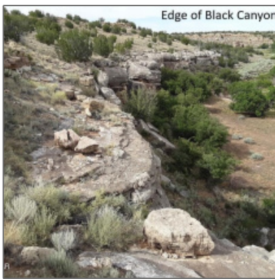
Edge of Black Canyon